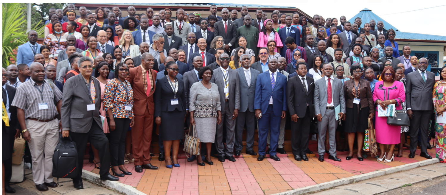
Conference Participants Group Photo

Please visit the AfricaLics website for more information about the conference here .