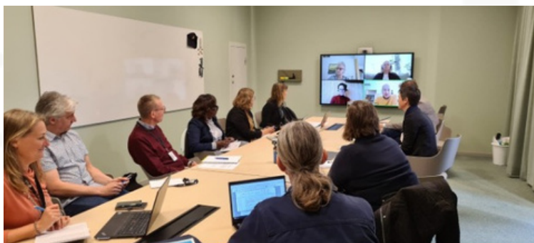
Participants at the Joint AfricaLics – Sida seminar in Stockholm