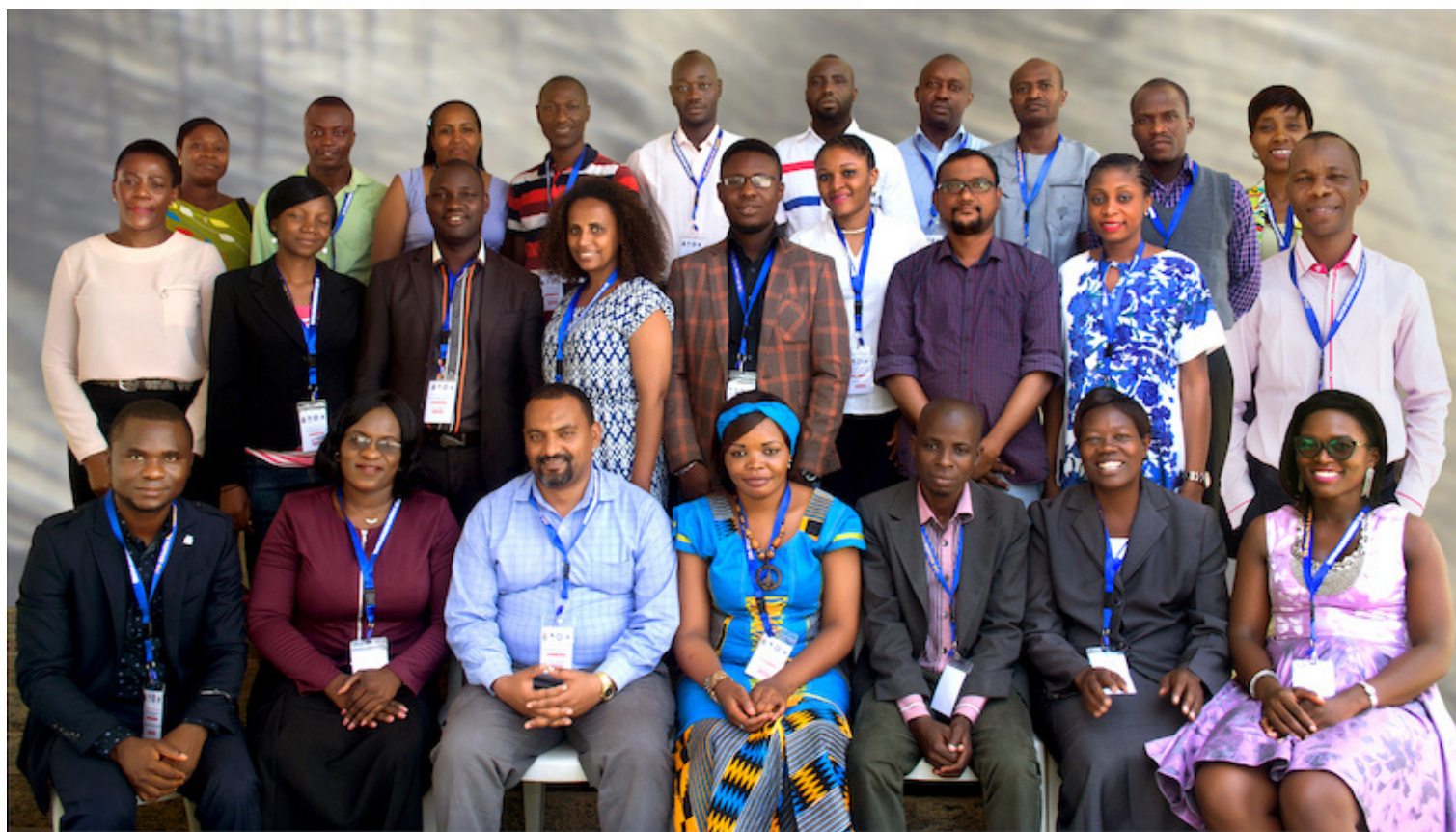
Nigeria PhD Academy Participants 2015

The first NigeriaLics Ph.D. Academy will be held from February 1st - 8th 2023 at the University of Lagos, Lagos, Nigeria. The Academy is expected to be a West African event rather than a Nigerian event. Applications attracted scholars from Ghana, Burkina Faso, and the Benin Republic. Part of the event will be supported by AfricaLics under Sida's research capacity-building funds. The AfricaLics Scientific Board congratulates NigeriaLics for this great milestone.