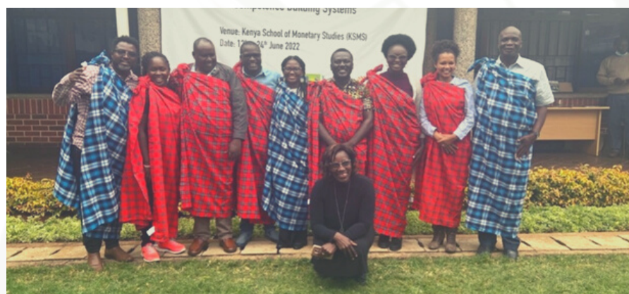
The winning group (Group 3)

Group 3: Enhancing the Emerging Climate-Smart Businesses through Government, Industry, and Academia Interaction.