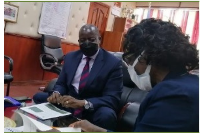
The Vice-Chancellor & AfricaLics Secretary General signing the MOU at JOUST Bondo Campus

The MoU between JOUST and ACTS resulted in the revamping and renaming of an existing program as an institute/center, which opens significant opportunities for mainstreaming the R&D and anchor the VFP and the launched Master's and PhD degrees programme at the university. The JOUST management team was delighted to fast-track the formalisation process needed to assist in getting this programme off the ground. The AfricaLics PhD Academy and the VFP programme are supported by the Swedish International Development Cooperation Agency (Sida).