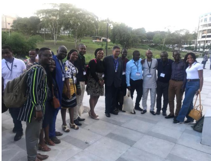
Figure 1: NigeriaLics pioneer members at AfricaLics conference in Dar es Salaam, Tanzania.