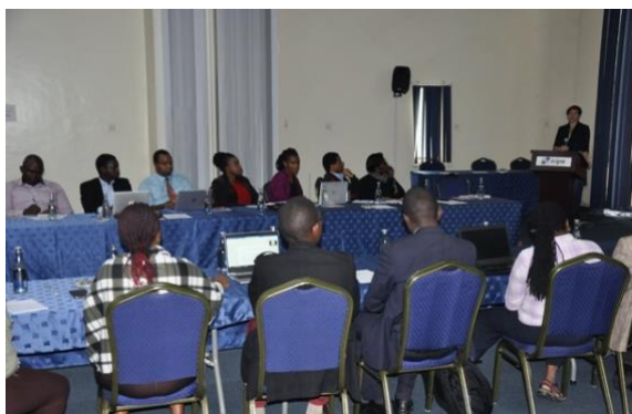
Joint CB4ICT & AfricaLics Seminar, Nairobi, Kenya

Building institutional capacity for computing research in Kenya (CB4ICT) project which is part of a global program “supporting Science, Technology Engineering Mathematics (STEM) research cultures in Africa” in collaboration with AfricaLics held a seminar on 28th January 2020 at the ICIPE Duduville Campus, Nairobi, Kenya. The theme of the seminar was “The Relevance of Science, Technology and Innovation Studies: Linking Academia and Industry.”