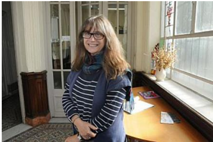
Prof. Judith Sutz

Following an ASB meeting held in Dar es Salaam, Tanzania in October 2019, an agreement was arrived at to set up a Constitution Committee as provided for in the Constitution that would oversee implementation of different aspects of the current AfricaLics Constitution.