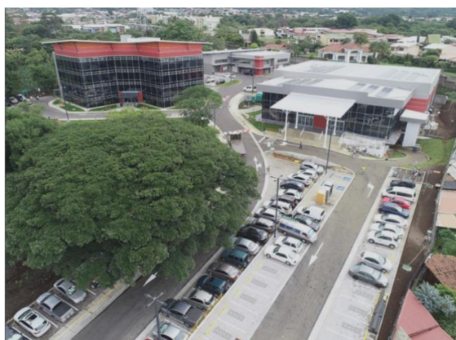
San Pablo Complex Convention Center

Selection of papers will be based on a peer review process that focuses on relevance, academic quality and originality. Globelics reserves the right to use available software to control for plagiarism and to take appropriate action in such cases.